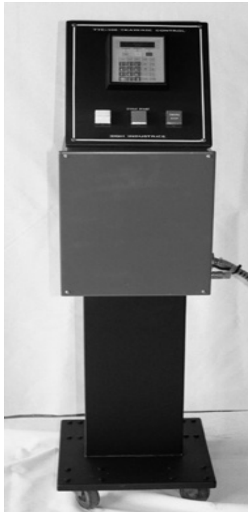
TM-600E CONTROL CONSOLE